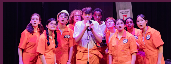
Static Air (2023)