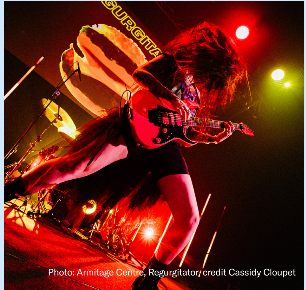
Photo: Armitage Centre, Regurgitator

Production labour charges apply for pre-rigging and venue restoration where alterations to the standard venue configuration are required.