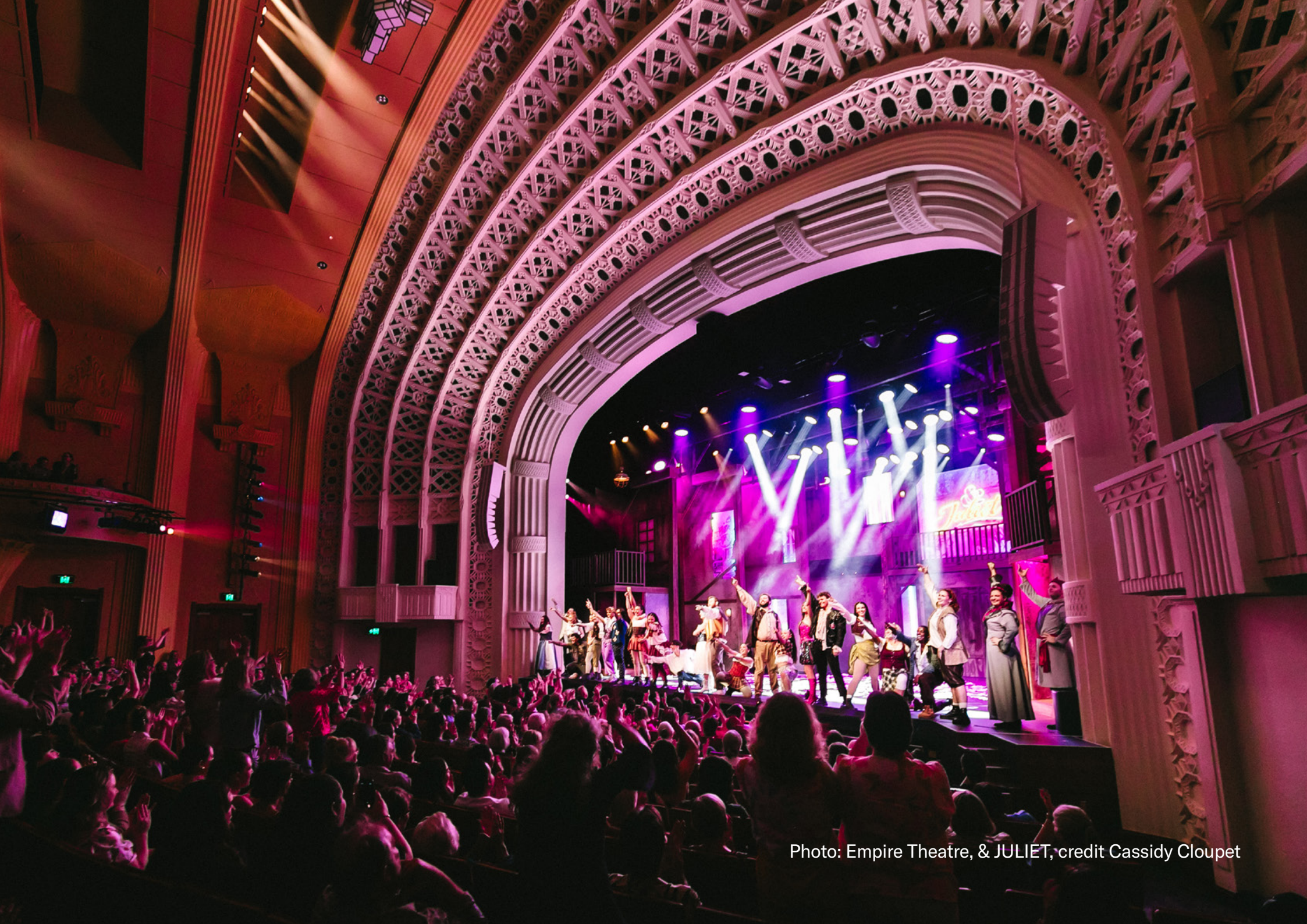
Photo: Empire Theatre, & JULIET