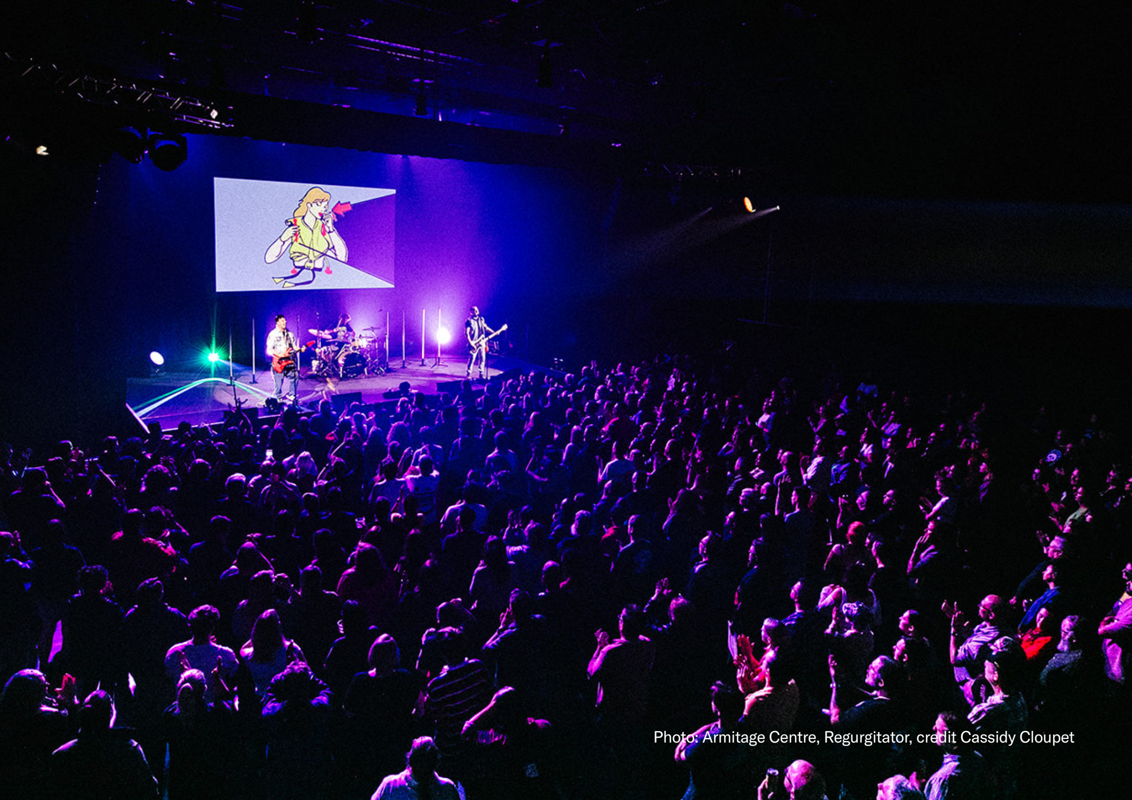
Photo: Armitage Centre, Regurgitator