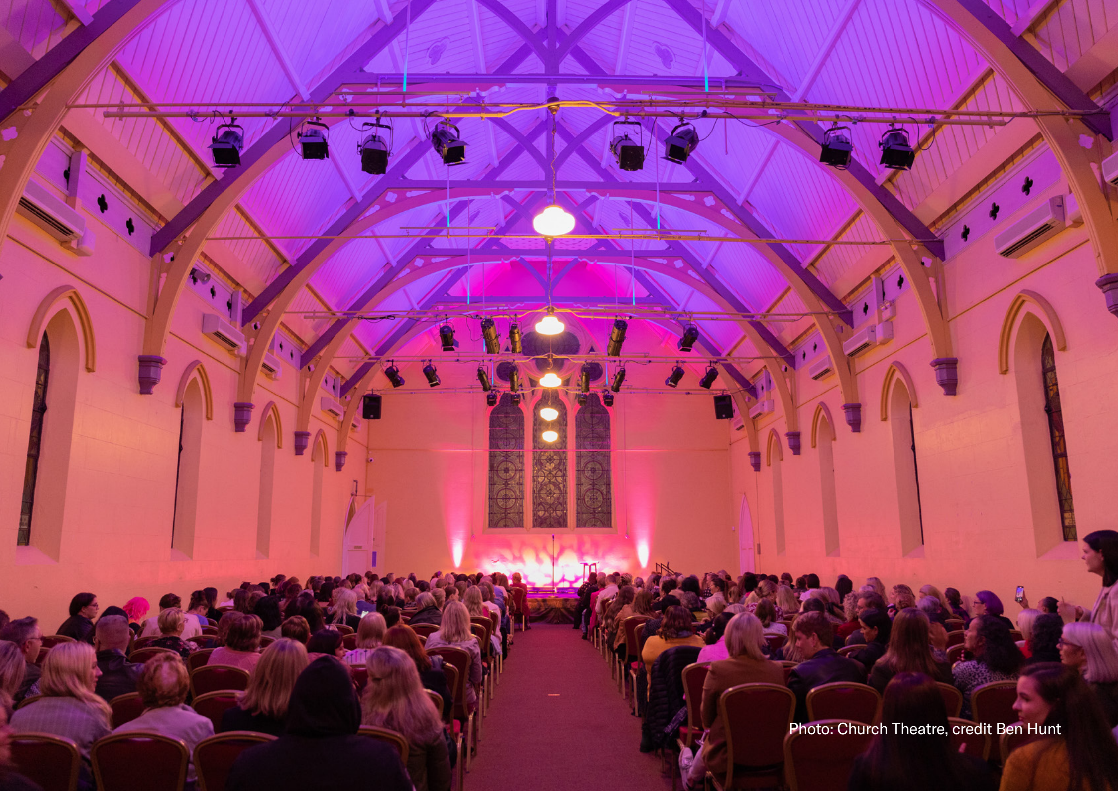
Photo: Church Theatre