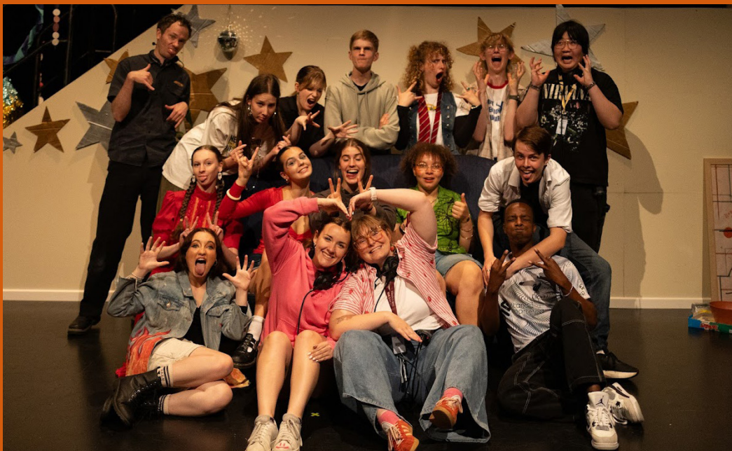
The 2025 Senior IMPACT Ensemble + Creative Team