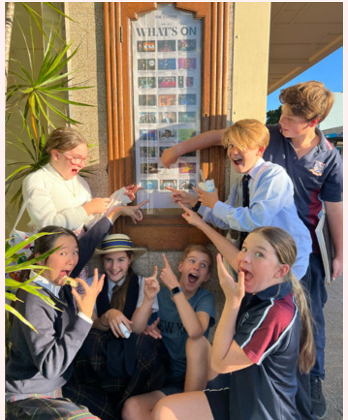
Junior IMPACT discovering their show's advertisement at The Empire