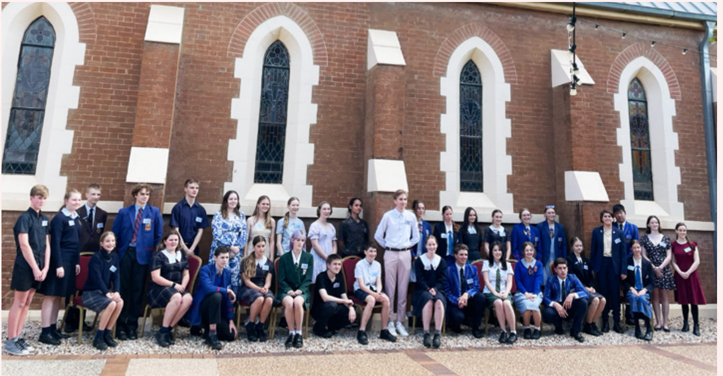
Recipients of the 2022 Youth Bursaries gather outside the Empire Church Theatre

The Empire Theatres Youth Bursary program last year saw a record number of recipients and bursary funds awarded, making 2022 the largest year yet.